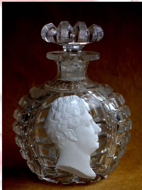
Perfume bottle (private collection)