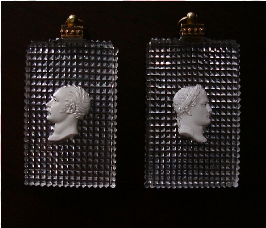
A pair of pendant with inlaid cameos

In the 70's, a ceramic worker and his associate, retrieve the old secret of the ceramics incrustation and start cameos fabrication. This small society offers their ceramics at all the crystal factories. The Franklin Mint Corporation contacted in France, to start and market the fiction name "Cristal d'Albret" : this is in reality not a Crystal factory but just a marketing logo ! Lots of sulphides are edited under this fake crystal factory name! Dumping prices and the quickly disappearance of this little ceramics cameo factory are the results. The cameo sulphide Art is a very height Tec department of the crystal Glass Art making. It is very rarely to find a crystal factory or glass Artist around the world that to control this Art! Today and since several decades just Baccarat and Saint Louis continuous this nice and difficulty Art. And other, but important point for collectors, remember this: beautiful and rares cameo sulphides from the XIX th century are all made in lead crystal, never in common glass ! For prove ,in the scientific analysis on paperweights from all the greatest factories of this time, Vonèche, Baccarat, Clichy, Saint- Louis, Mont-Cenis, Aspley Pellat etc... we retrieve a lead percentage over 35 % This is confirmed in the fabrication archives of these crystal factories. Full lead crystal with his deep brightness and density is the must for this hi-Tec glass Art.