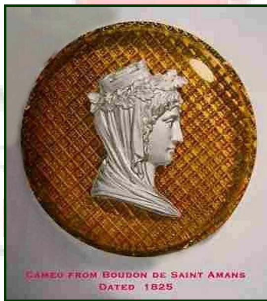
One of the first inlaid cameo. A beautiful realisation for the date.