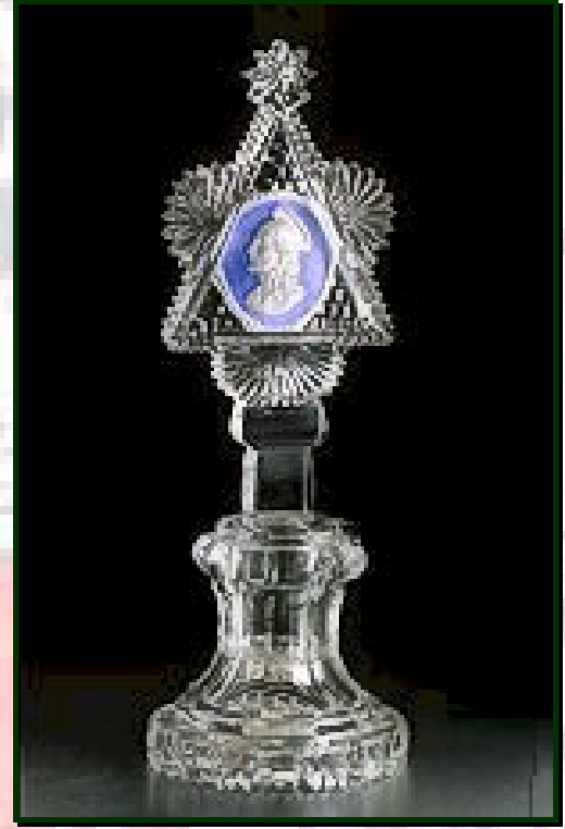
Icon > inlayed in Bohemia

These two items have the same inlayed cameo of Jesus Christ