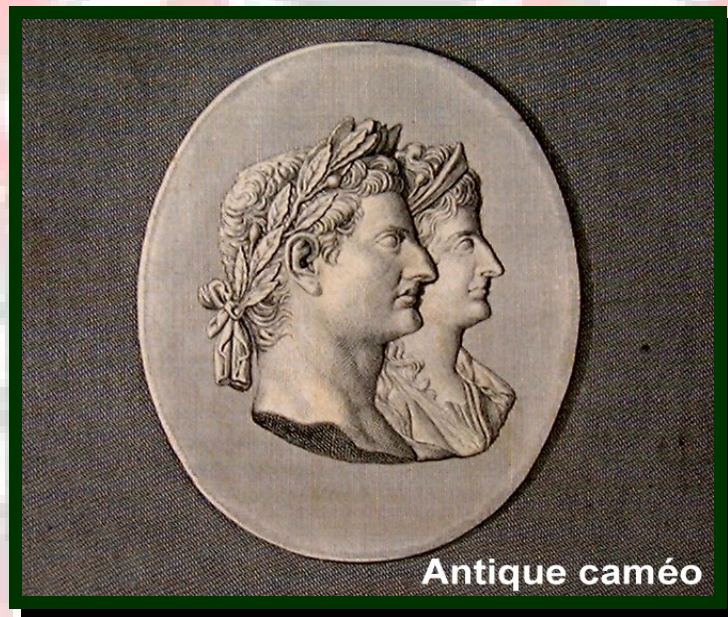
An Antique cameo picture

A small and brief description of the cameo incrustation and sulphides glass Art