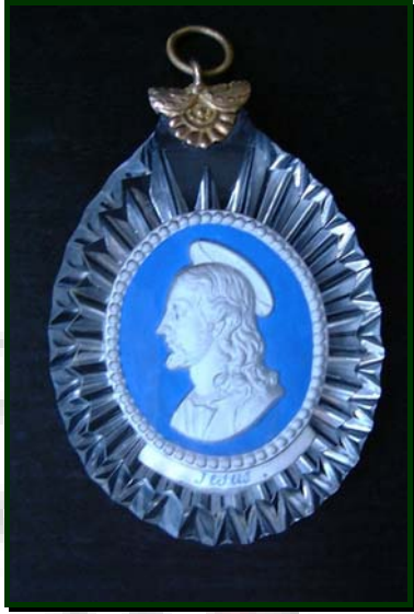
Pendant > inlayed in France

In many circumstance we find the same cameos, inlayed in different items and coming from different countries.